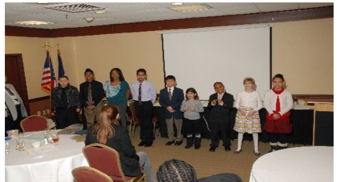
Contestants in the District CCDHH held on February 25 in